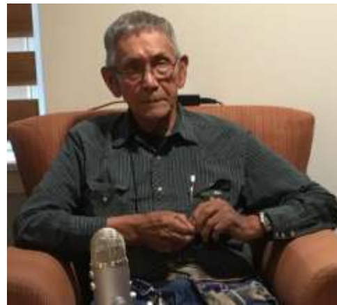
Q w ǰmnaǰs